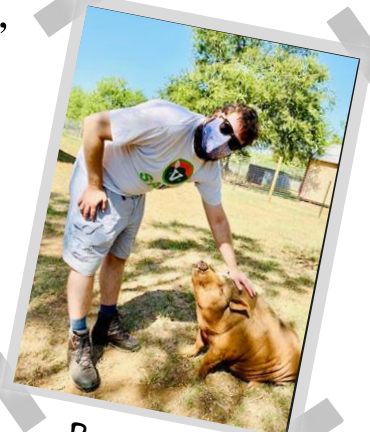
Penny is sitting pretty